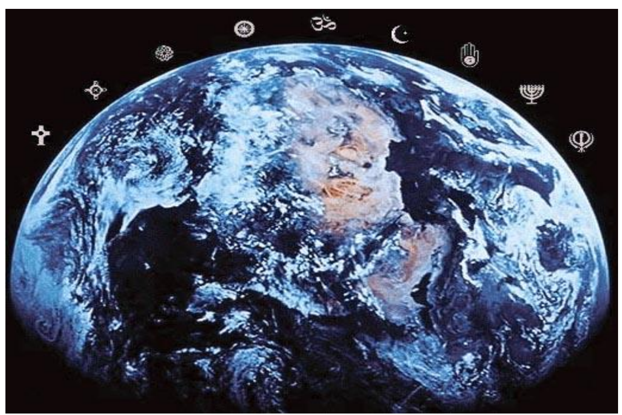
United Religions Initiative - Youth Global Network Symbol For New Global Religion